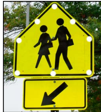
School Crossing (S1-1)