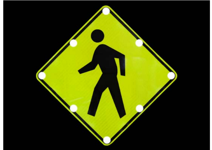
Pedestrian Crossing (W11-2)