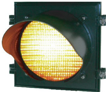
Shown with amber LED

** Call for availability. Some sizes or styles may not be available in these voltages.