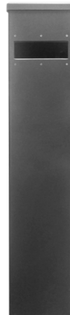
Clear hard anodized

Photo-Sensor Bollards can trigger flashing signs and in-pavement lights.