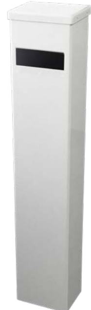
White powder-coated (standard)