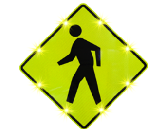
Photo-Sensor Bollards can trigger flashing signs and in-pavement lights.