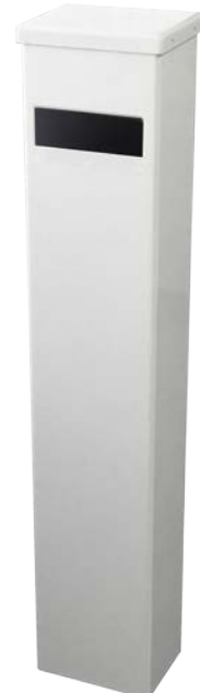
White powder-coated (standard)