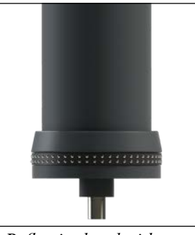
Reflective band with two rows of glass elements.