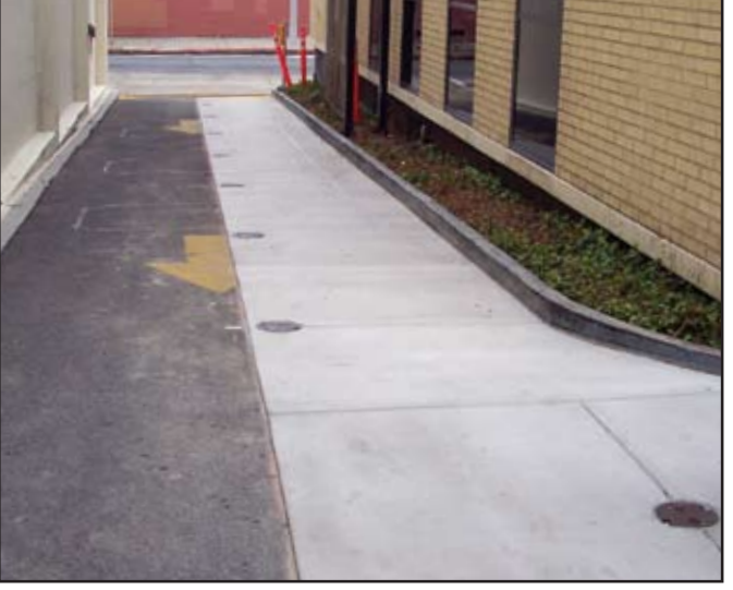
Fully-flush fixtures delineate the pedestrian path in the driveway

the fixtures in line with the pathway so cars would see them. Drivers need to see the LED lights. This is the single most important requirement."