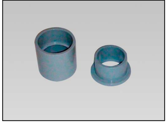
External Fitting (Left), Internal Fitting (Right)