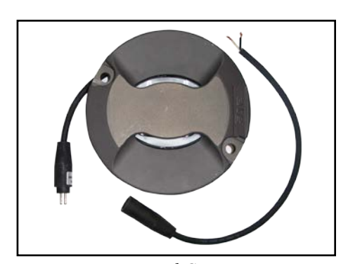
Fixture and Connector