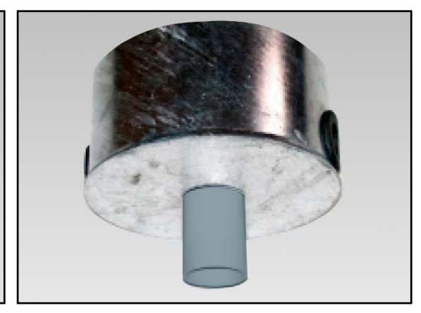
Base Can Shown with Fittings Installed