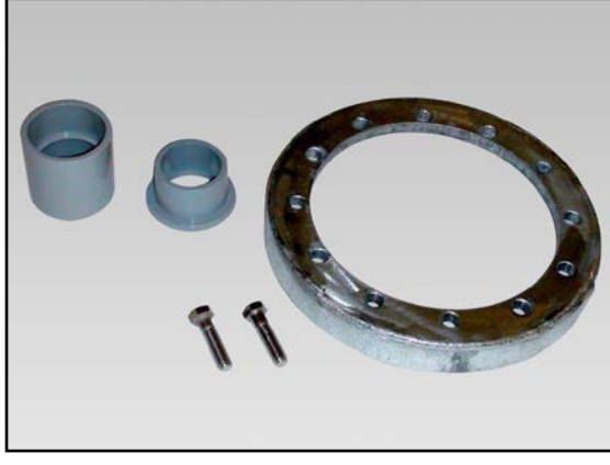
External Fitting (Left), Internal Fitting (Right) and Mud Ring with Bolts