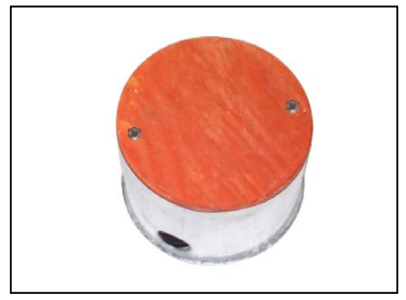
Base Can Shown with Cover Attached

1. Base cans are shipped with protective plywood covers. Remove the base can covers and store them in a safe location.