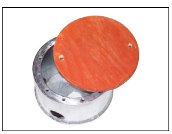
Base Can Shown with Cover Removed