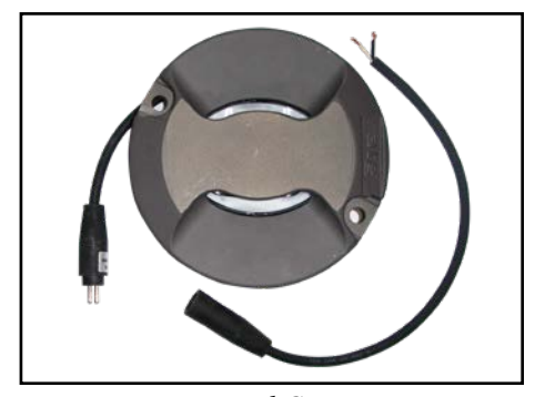
Fixture and Connector