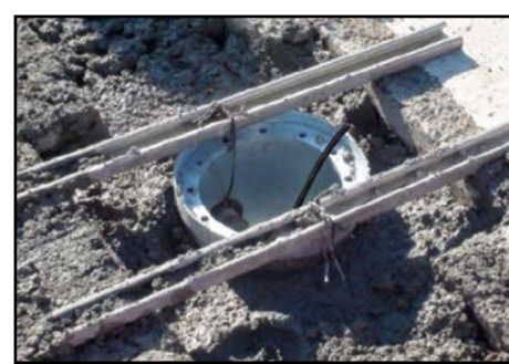
Mounting Jig Attached to Base Can