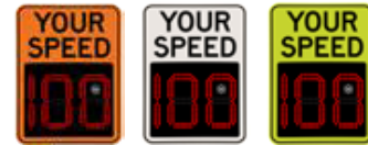
Choice of faceplate colors available.