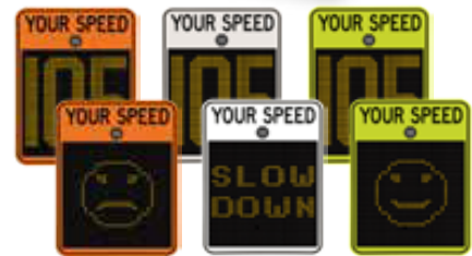
Choice of faceplate colors available.