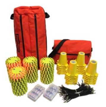
Available kits include one Cone-Top Adapter per PowerFlare, and are available in packages of 2, 4, 8, 12, and 20. Standard kits come with Red, Amber, or Red/ Blue LEDs in yellow shells.