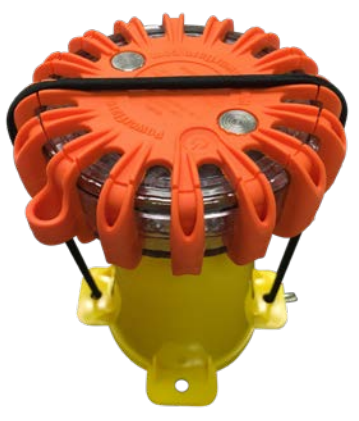
Magnetic PowerFlares attach to an internal piece of metal in the Cone-Top Adapter. with