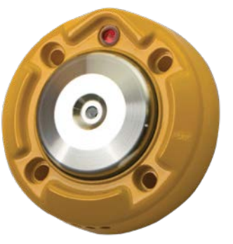
BullDog III Push-Button