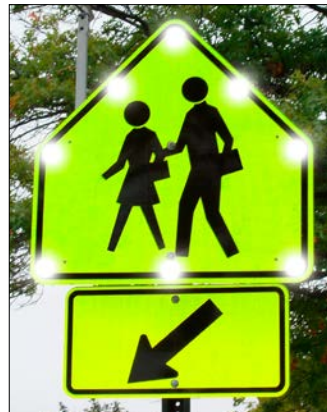
School Zone Crossing Sign (S1-1)