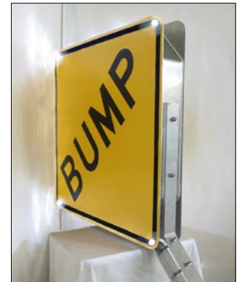
Double sided configuration

+1.888.446.9255 USA +1.916.394.9884 Worldwide +1.916.394.2809 Fax