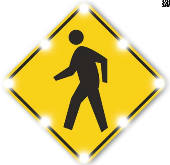
Pedestrian Crossing Sign (W11-2)