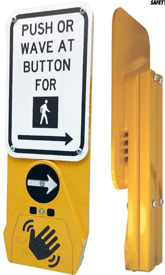
Place a call with the wave of a hand