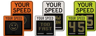
Choice of faceplate colors available. Compact and standard faceplate sizes available.