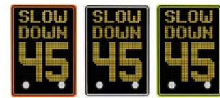
Choice of faceplate colors available.