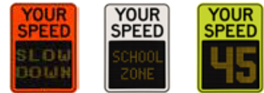
Choice of faceplate colors available.