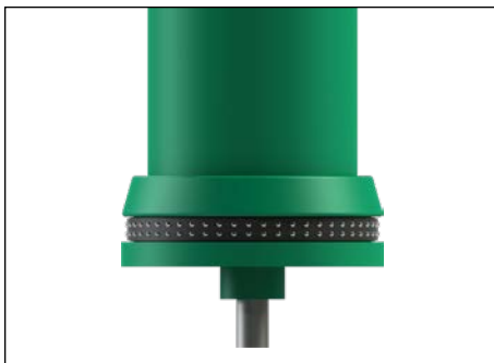
Reflective band with two rows of glass elements.