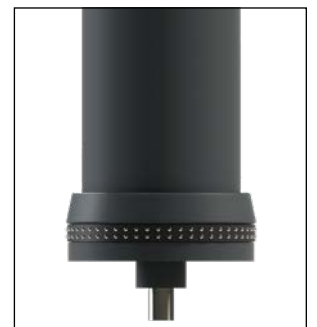
Reflective band with two rows of glass elements.