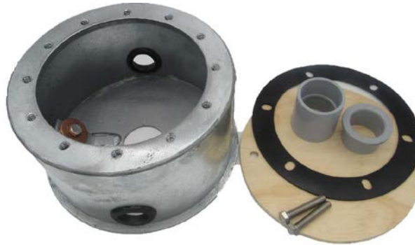
Base Can Shown with Accessories