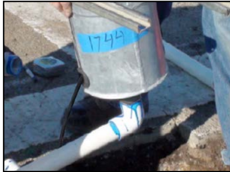
Base Can Attached to Drain Conduit