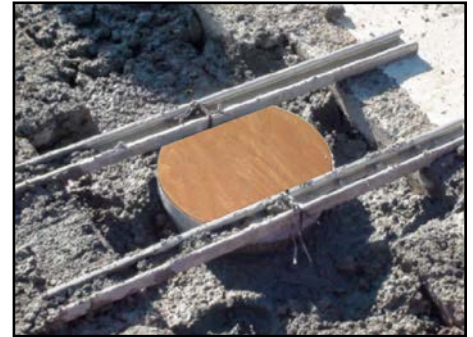
Base Can Installed in Roadway