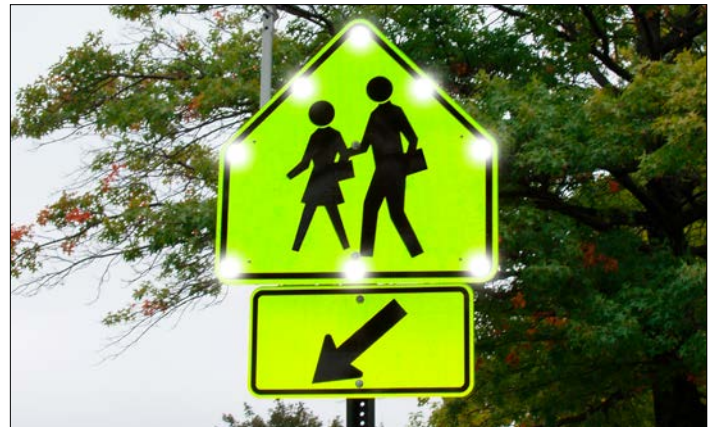
School Zone Crossing Sign (S1-1)

+1.888.446.9255 USA +1.916.394.9884 Worldwide