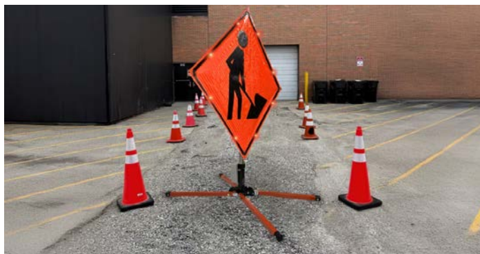
Stand not included