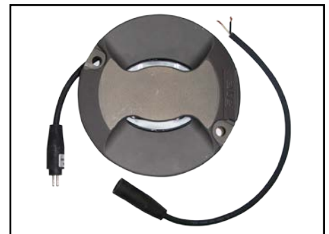
Fixture and Connector