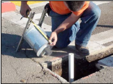
Mounting Jig Attached to Base Can