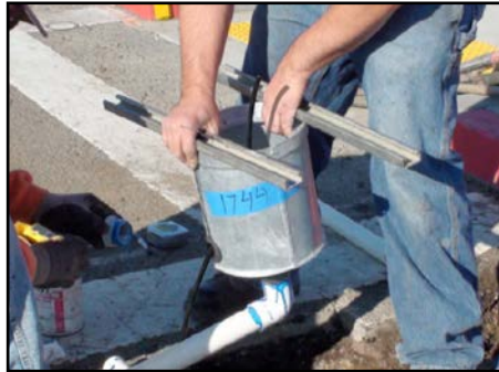
Base Can Attached to Drain Conduit