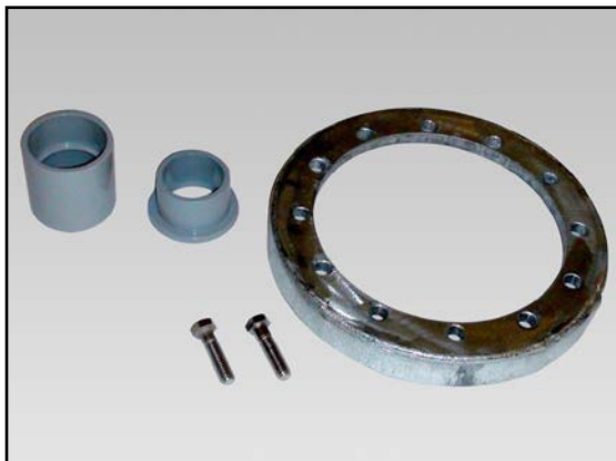
External Fitting (Left), Internal Fitting (Right) and Mud Ring with Bolts