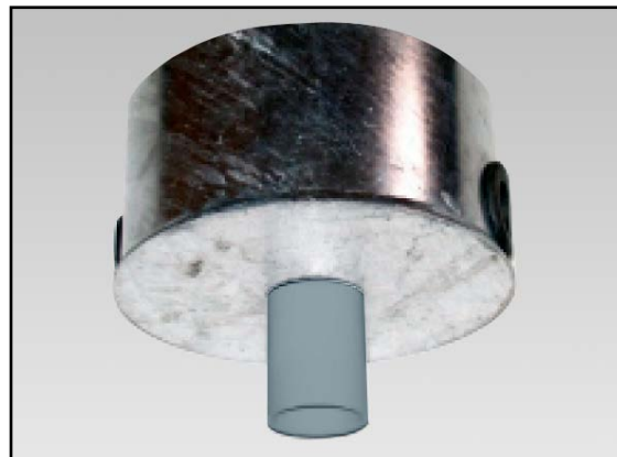
Base Can Shown with Fittings Installed