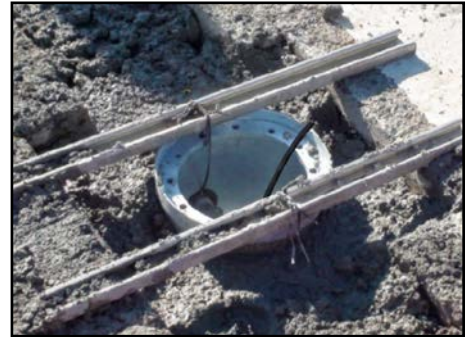
Base Can Installed in Roadway