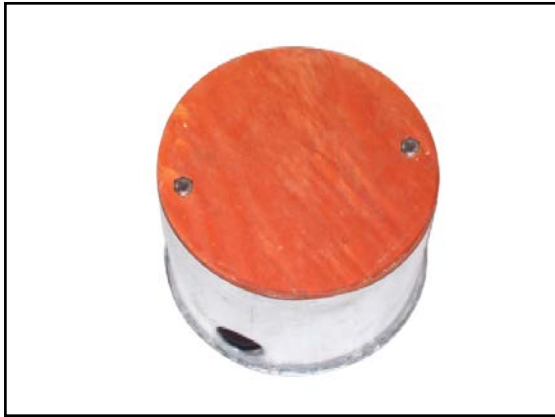
Base Can Shown with Cover Attached