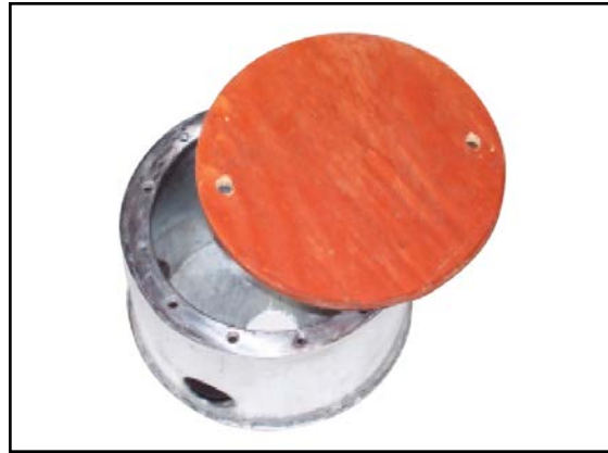
Base Can Shown with Cover Removed